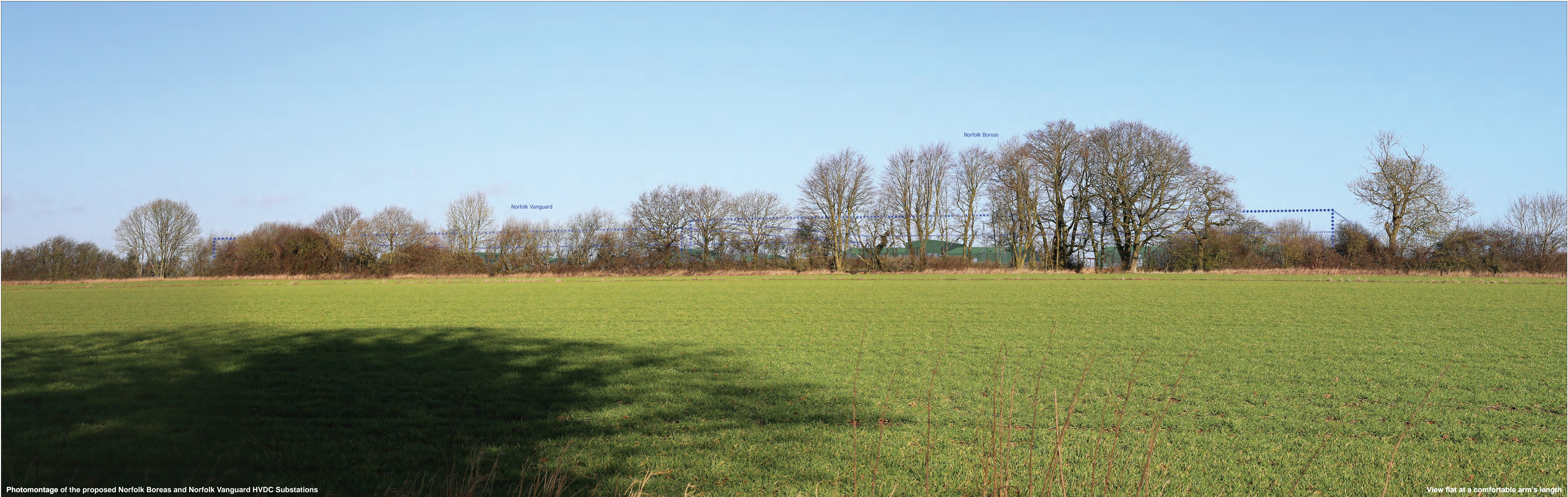
Photomontage of the proposed Norfolk Boreas and Norfolk Vanguard HVDC Substations