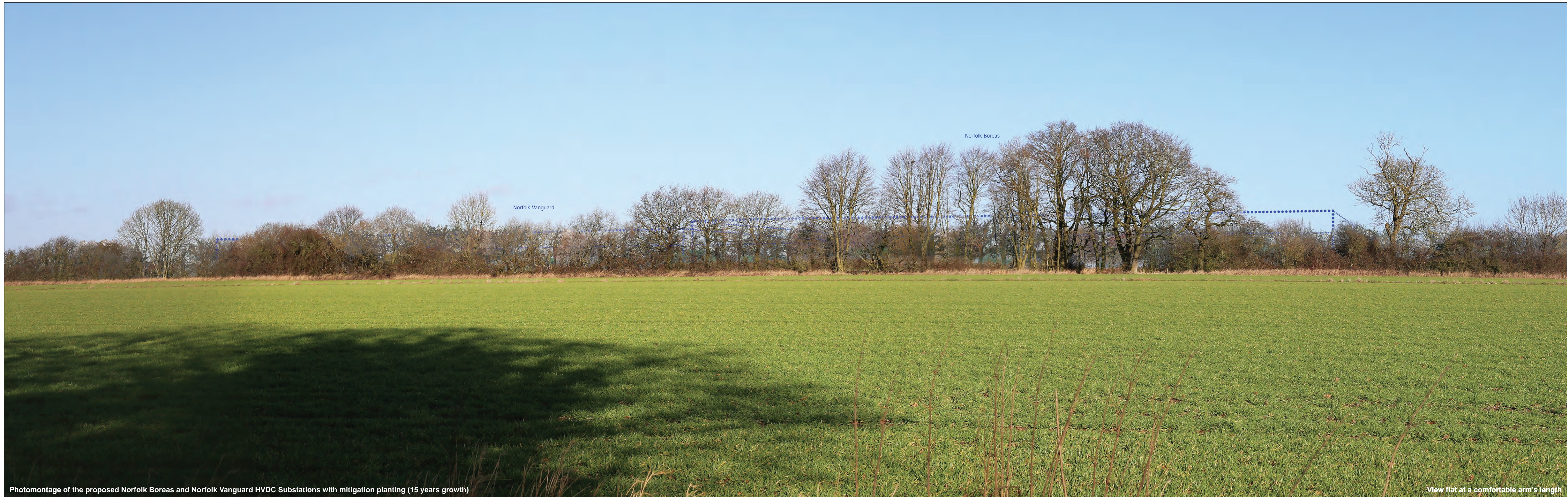
Photomontage of the proposed Norfolk Boreas and Norfolk Vanguard HVDC Substations with mitigation planting (15 years growth)