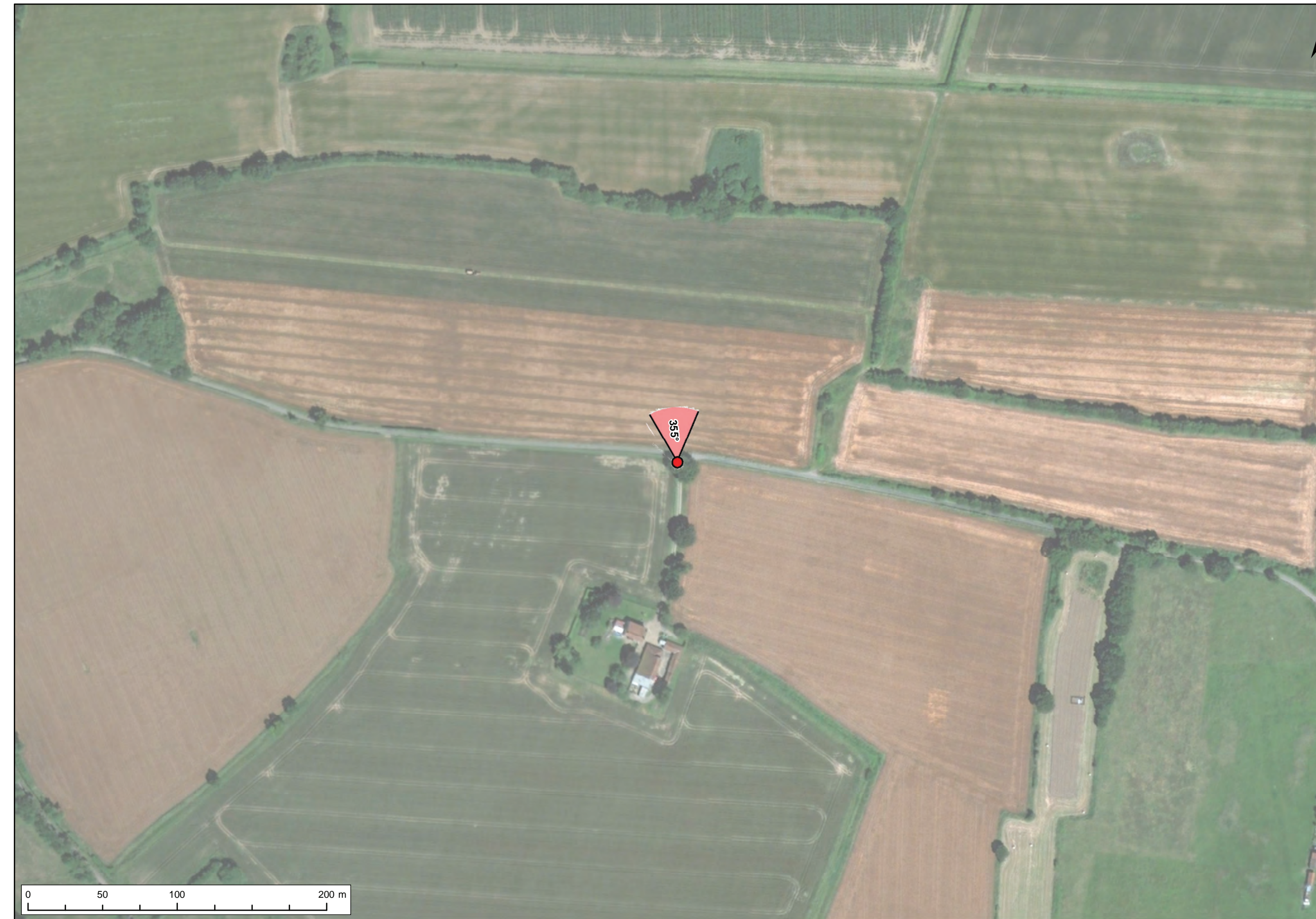
Viewpoint Location Plan (53.5 Degree View) Scale: 1:2,500